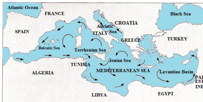
Figure 3: Generalized surface circulation pattern in topographic units of the MS (after Cimerman and Langer, 1991).