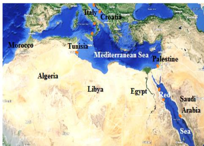
Figure 1. Location map of the studied localities in the Mediterranean Sea (Italy, Croatia, Tunisia, Palestine) and Red Sea (Egypt, Saudi Arabia).

The present study deals with the record of 174 Miliolid Recent benthic foraminiferal species from 6 localities in the Mediterranean Sea, and 3 localities in the Red Sea (Figure 1).